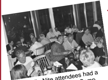
Daltile Nite attendees had a "high" time at High Camp