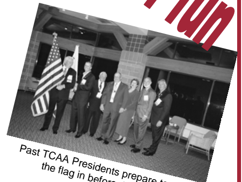
Past TCAA Presidents prepare to carry the flag in before the Dinner