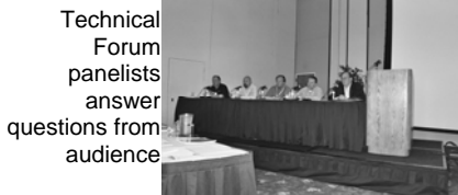
Technical Forum panelists answer questions from audience